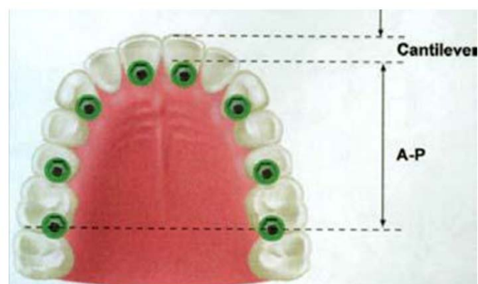
Figure 2: The maximum anterior-posterior distance is desirable

If the adjacent implants are not in a straight line, less pressure will be transferred to the bone connection of the implant 40 (Figure 3). Cross arch support is also important.