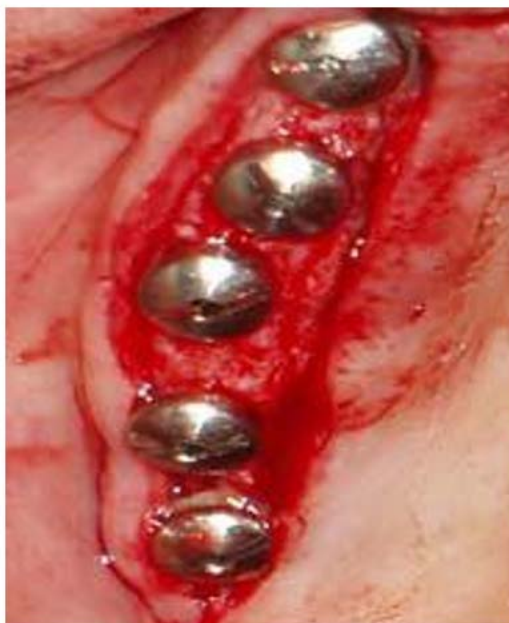
Figure 3: Implants should not be on a straight line as much as possible

The temporary prosthesis made for immediate loading should not have a posterior cantilever. Because the posterior cantilever is not important from the point of view of beauty, and due to the high welding forces in the posterior region, it will have a destructive effect on the implants. In addition, these temporary prostheses should be attached with permanent cement because if the cement is lost in a part of the prosthesis, a cantilever will appear. 29