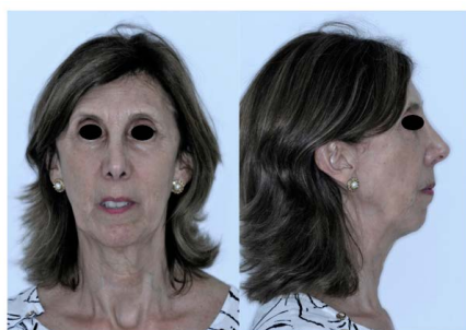
Figure 1: Preoperative front and profile view